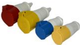
Couplers (yellow 110v) (blue 230v) (red 415v) 16a 32a 63a