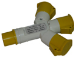
110v 3-way connector