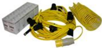
22m festoon kits, 10 lamp holders, 10 bulbs, 10 guards, fitted with 110v 16a plug