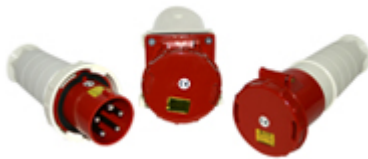
63a IP 67 plug coupler and wall mounting sockets