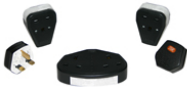
13a 230v range single trailing socket, twin trailing socket, 13a resilient plug BS1363A