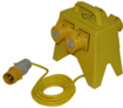
4-way 16a 110v GRP splitter box c/w 5m 1.5 or 2.5 cable