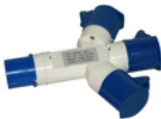
230v 3-way connector