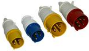
Range of plugs 110v 230v 415v 16a 32a 63a