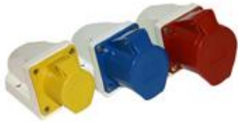
Wall mounting sockets 110v 230v 415v 16a 32a 63a