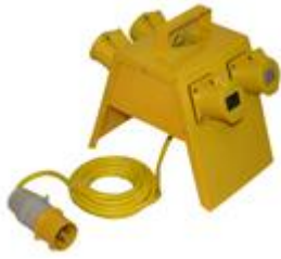
4 way 16a 110v metal splitter box c/w 5m 1.5 or 2.5 cable